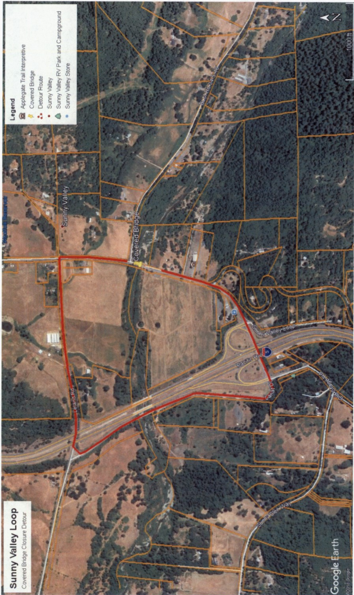
Exhibit 1 WBS 10.2.19